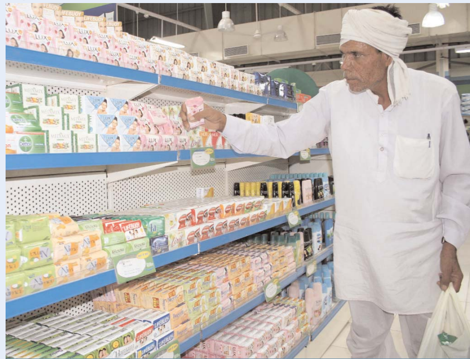
SPOILT FOR CHOICE: A farmer shopping at Chaupal Sagar in Rafiqganj