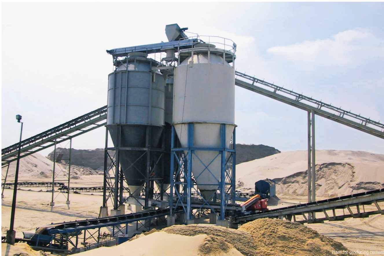
Plant for producing cement

G ROWING awareness about the hazards of pollution is triggering off demand for air pollution control equipment (APCE) as industries – ranging from power plants to cement manufacturing units – are investing in new technologies to curb emissions.