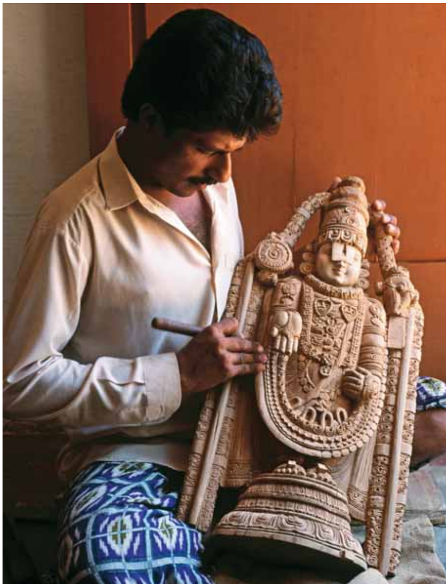
GAINING FROM THE GROWTH STORY: It is important that all sections of society benefit from economic growth

to happen in India is in agriculture, he says. This is a sector that poses major challenges, but overcoming them would ensure all inclusive growth.