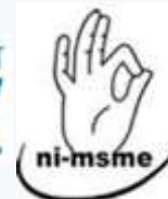
National Institute for Micro, Small and Medium Enterprises, (NI-MSME)