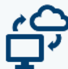
Technology Centre Systems Programme