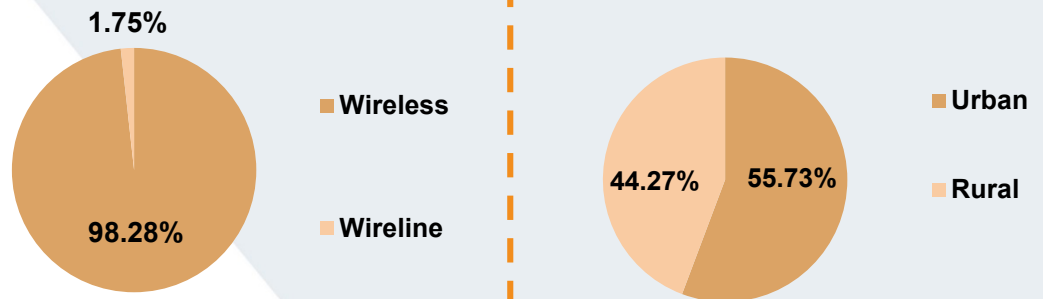
Composition of Telephone Subscribers (FY20)